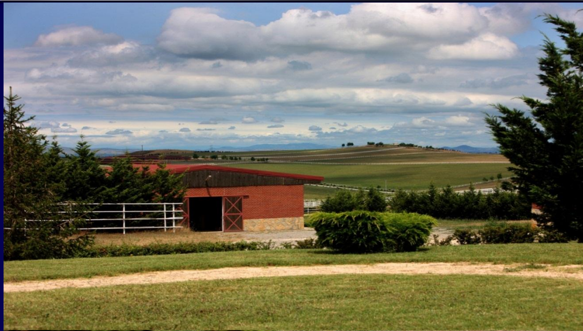
Jockey Club of Turkey, Karacabey Stud Farm