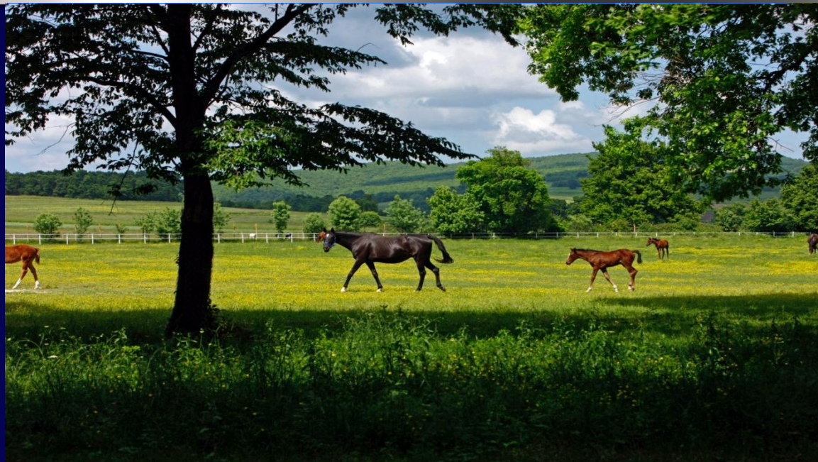
Jockey Club of Turkey, Izmit Stud Farm