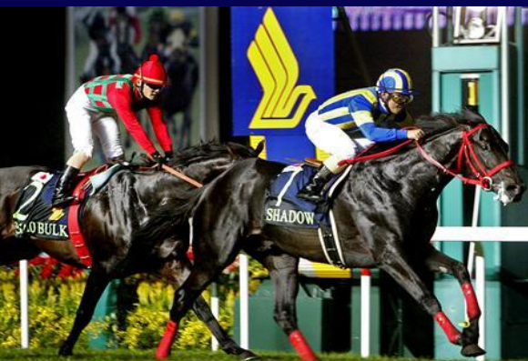
Singapore Airlines International Cup