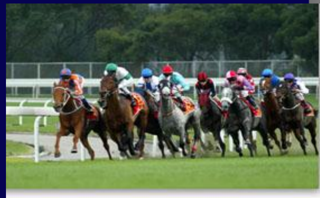
China International Racing Festival ?