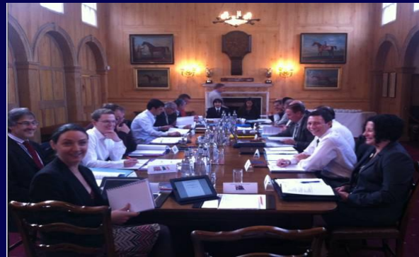
ISBC meeting at Jockey Club Rooms in Newmarket