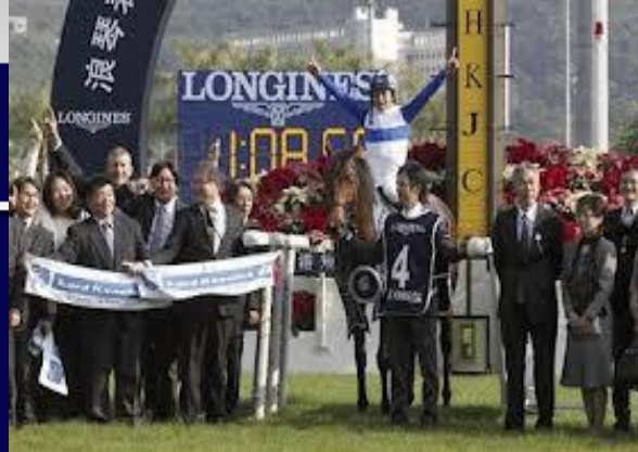
Longines Hong Kong International Races