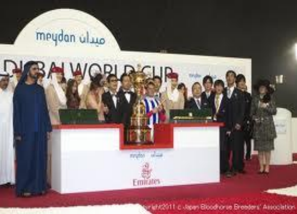
Dubai World Cup Carnival