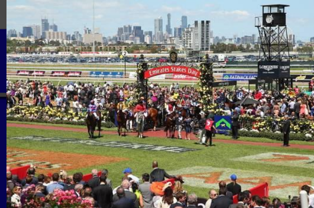
Melbourne Cup Carnival