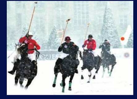
Fortune Heights Snow POLO World Cup