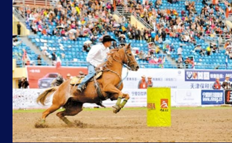
IBHF International Barrel Racing World Cup