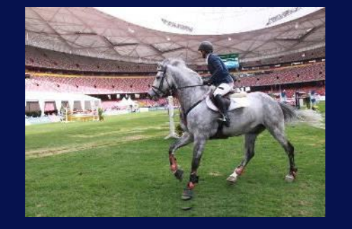
Longines Beijing Master