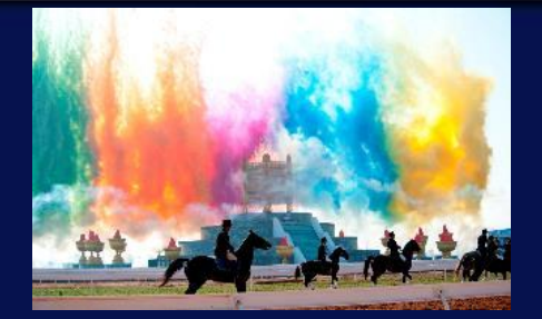
Chinese Equestrian Competition