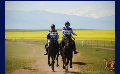
National Endurance Tour