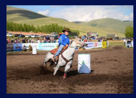
National Barrel racing Tournament