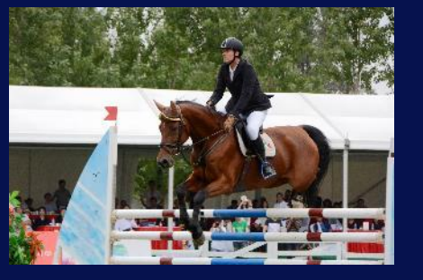
Sherwood International Show jumping Grand Prix