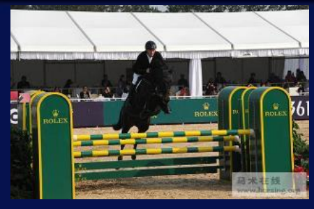
FEI World Cup Jumping China League