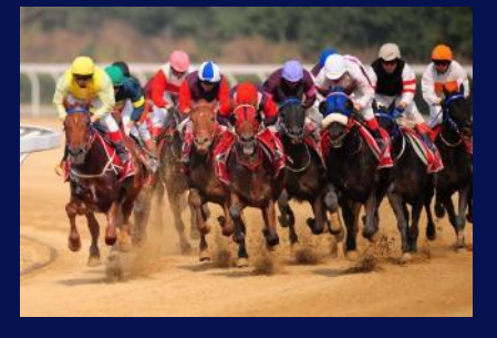
National Horse Racing Tournament