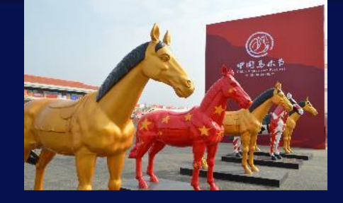
Chinese Equestrian Festival